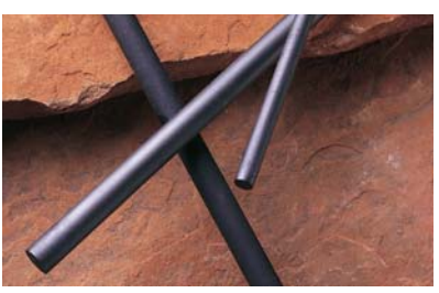
LIDA<sup>®</sup> Rod Anodes